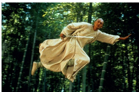
Crouching Tiger, Hidden Dragon

© 2000 United China Vision Incorporated for the World Excluding the United States and Canada and their Respective Territories and Possessions.